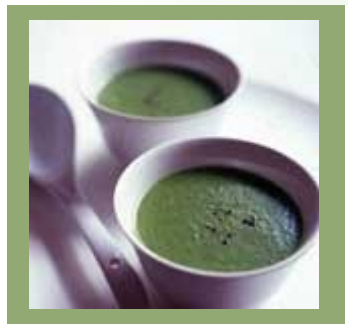
Watercress & celeriac soup